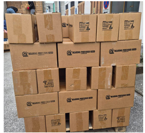
Unloaded boxes of scripture--more seed is in the barn!