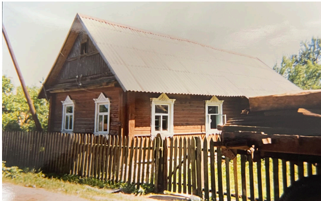
The village house that we converted to a church building