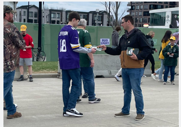
Collaboration of over 25 independent Baptist churches and nearly 300 believers to distribute over 80,000 John and Romans at the NFL draft in Green Bay this April