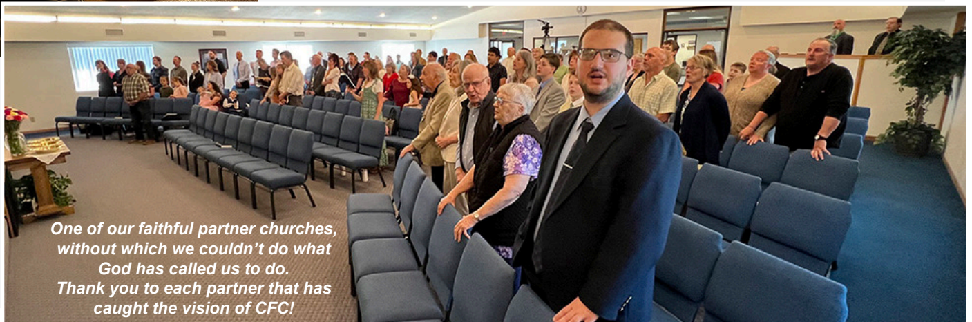
One of our faithful partner churches, without which we couldn't do what God has called us to do. Thank you to each partner that has caught the vision of CFC!