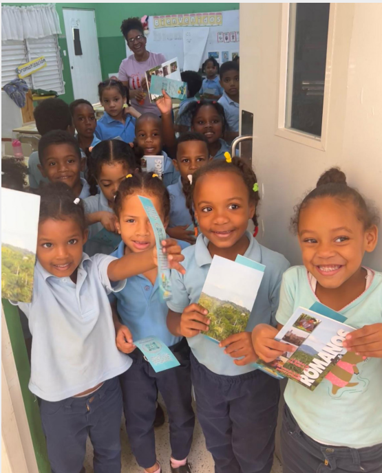
Kindergartners receive the gospel in the Dominican Republic in March

Ephesians chapter four has been called the unity chapter in this New Testament book. We are challenged in verse three to endeavor to keep the unity of the Spirit. As we read further in the chapter, we see that God gave us gifts for the perfecting of the saints, for the work of the ministry, and for the edifying of the body of Christ. As I reflect on the three trips to the Caribbean (E.P.I.C.), a container shipped to Malawi, another to Papua New Guinea, an NFL Draft outreach, and several hundred thousand Portuguese John and Romans assembled for Brazil over the first third of 2025, I am overwhelmed by how the Lord uses us as individuals, but even more so when we work together with those of like faith and practice. Just like it takes more than just my mind or my hand to take a drink of coffee, it takes more than just Couriers for Christ to place the Word of God into the hands of those who don't have it!