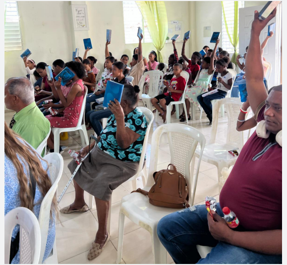
The Word of God freely given to visitors and church members alike as a result of the sacrificial giving of partner churches