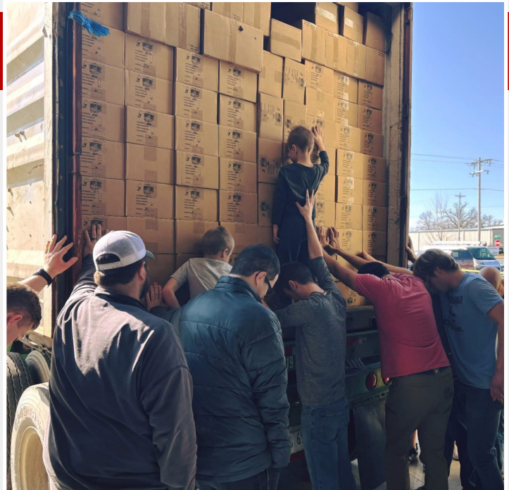
Another container filled with Bibles and songbooks for Malawi on its way right now!

The human body is amazing—because an omnipotent and omniscient God intricately designed it! As I sit here in my home office contemplating the goodness of our God and all that he has done in and through our ministry over the past couple of months, I reach to grab a sip of coffee. This is a routine movement that has been repeated for many years of my life, but in this moment, I begin to think of all that it takes to make this single action possible. My brain sends a signal to the muscles of my shoulder and arm, and with perfect precision my hand reaches out and grabs the mug, lifting it to the exact spot of my mouth. This enables me to take a sip of the coffee, but before that happens, the skin sensors on my face indicate how hot the coffee is and if I need to be extra careful. My lips keep the coffee from running down my chin and onto my shirt, not even to mention all that my body does “automatically” to process the freshly consumed liquid. All this is taking place automatically while I am concentrated on ministry work.