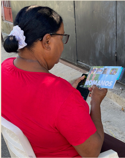
People gladly receiving the scriptures