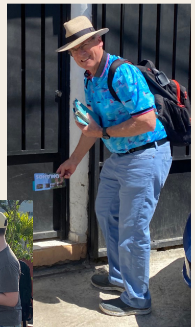
Top photo: "B" Team