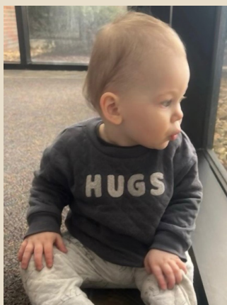
Our adorable great-grandson