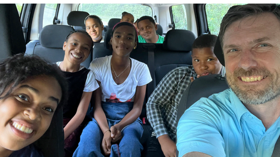
Above: Full house--praise the Lord!